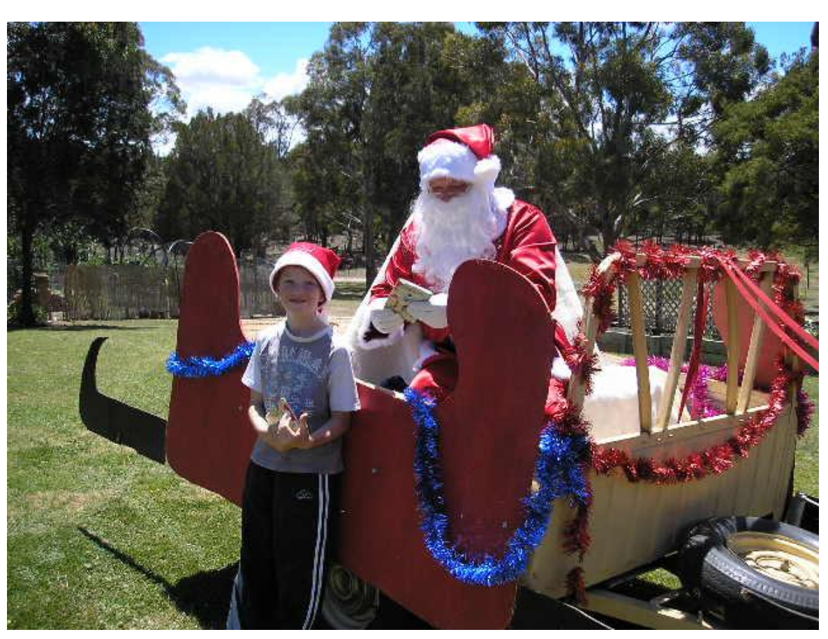
EJ-EH Holden Club ACT Inc Newsletter November /December 2008