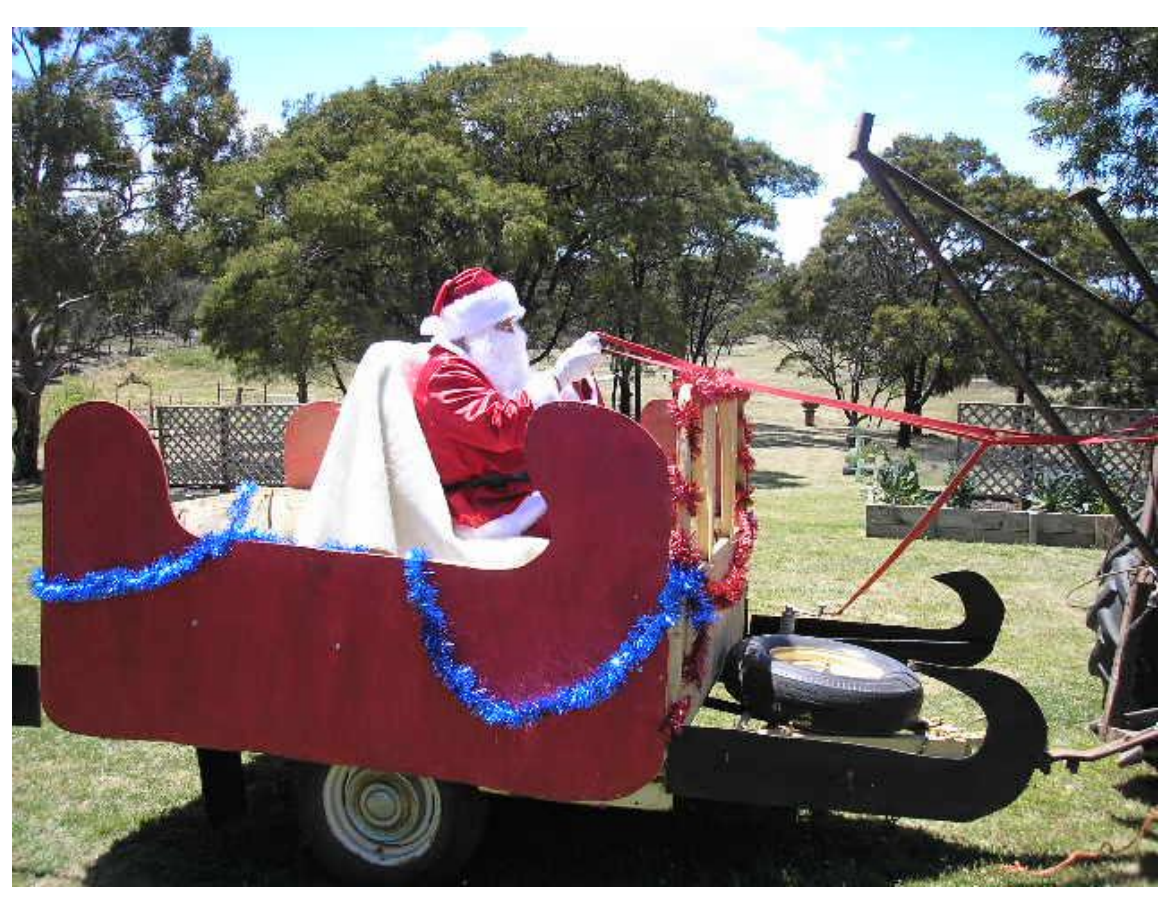
EJ-EH Holden Club ACT Inc Newsletter November /December 2008