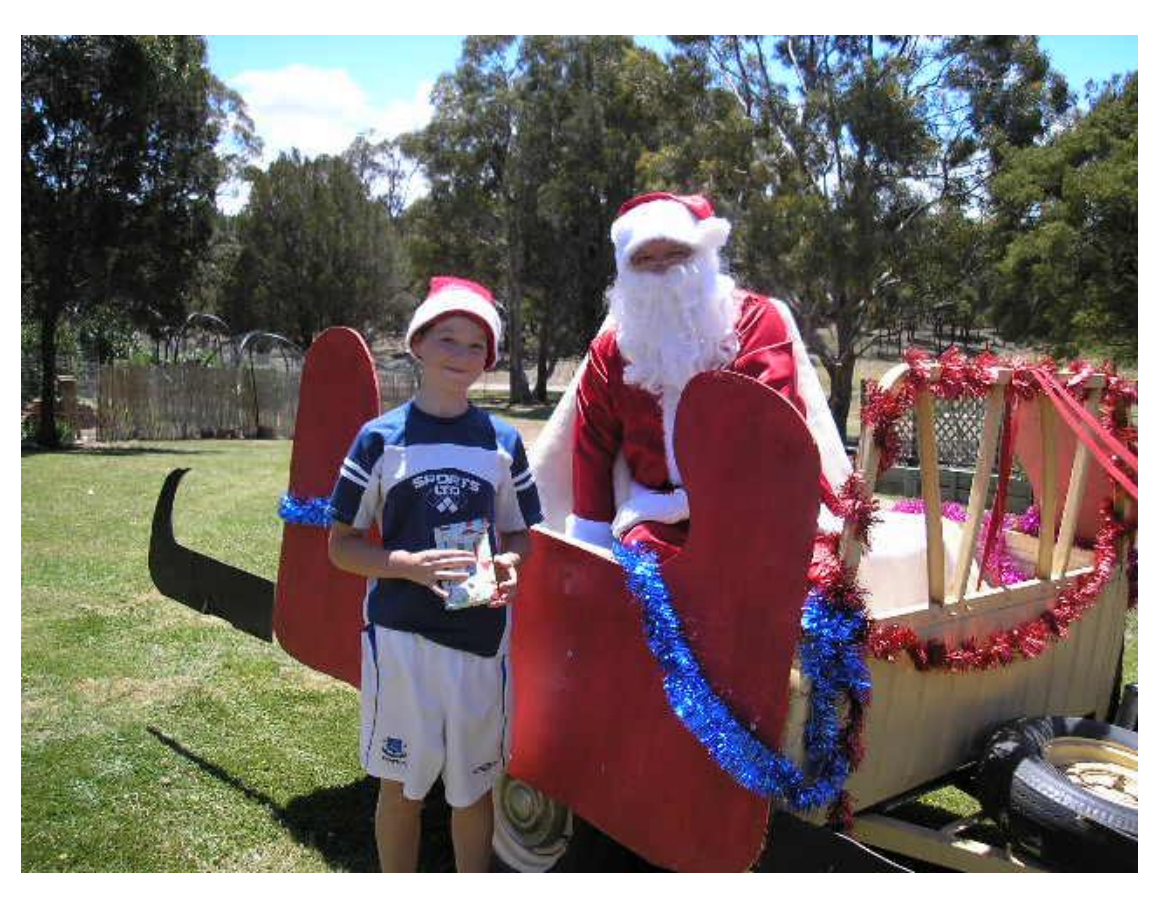
EJ-EH Holden Club ACT Inc Newsletter November /December 2008