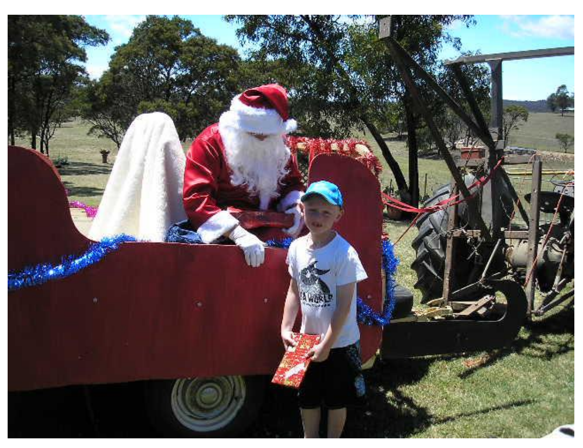
EJ-EH Holden Club ACT Inc Newsletter November /December 2008