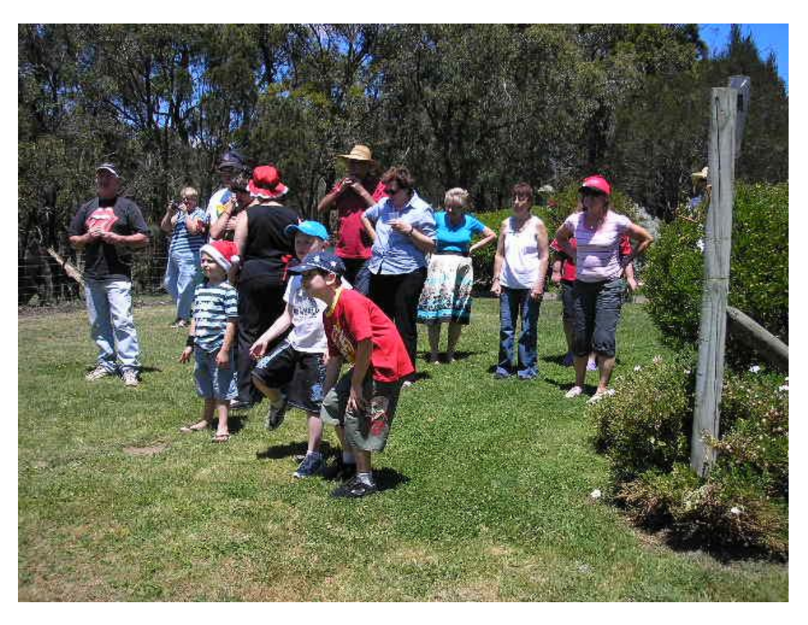
EJ-EH Holden Club ACT Inc Newsletter November /December 2008